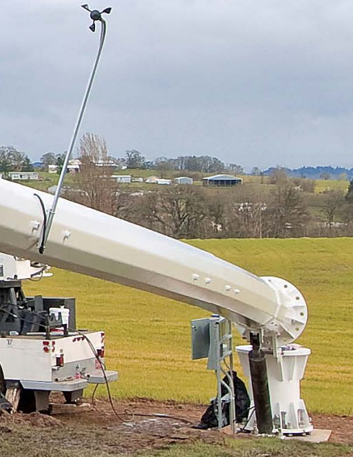
Tilt-up towers require a large, open site to raise and lower the tower, but guyed towers can be sited on cluttered sites and even between buildings.

It's common to find local or state statutes that restrict tower height to 30 to 60 feet—heights that hamstring a system to poor performance. These sorts of limits need to be challenged in administrative offices and courtrooms. Better yet, do the necessary education and change the permitting language proactively to avoid battles later on. Bowing to ordinances that limit tower height only results in poorly performing systems, and sets a bad precedent.